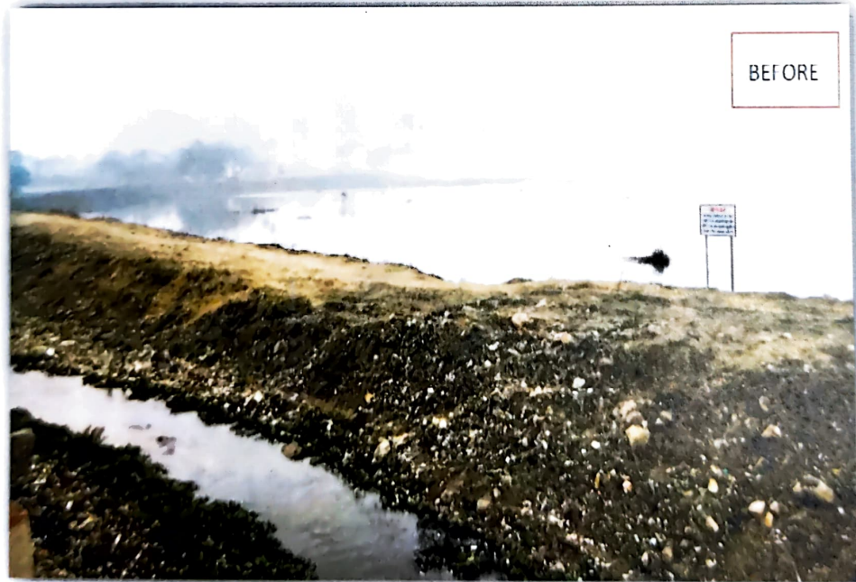
Figure: Showing preexisting bund before rejuvenation