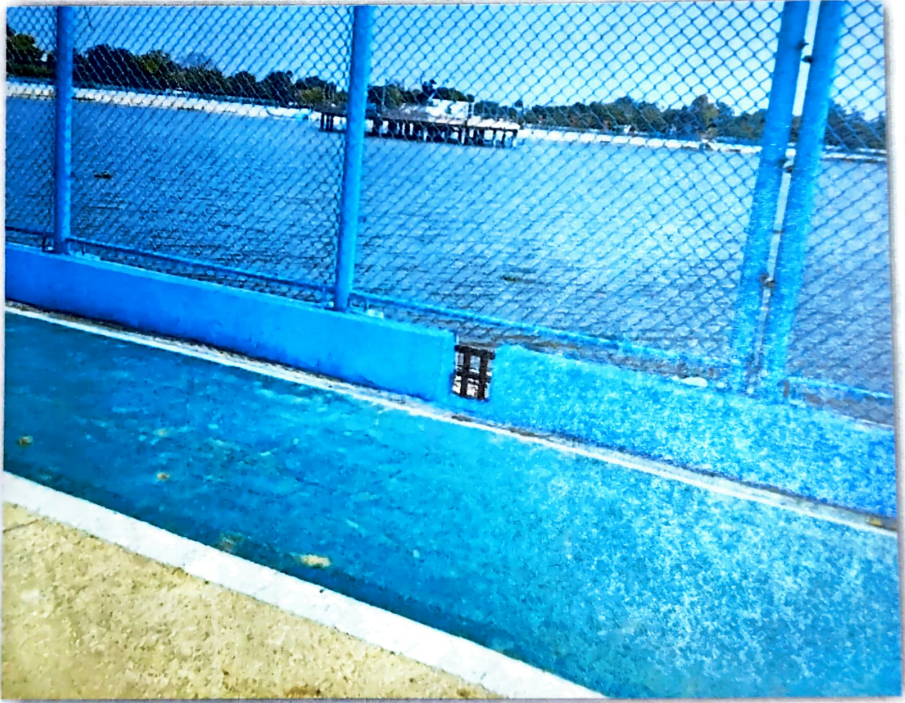
Figure: Showing 300mm x 230mm hole in the wall