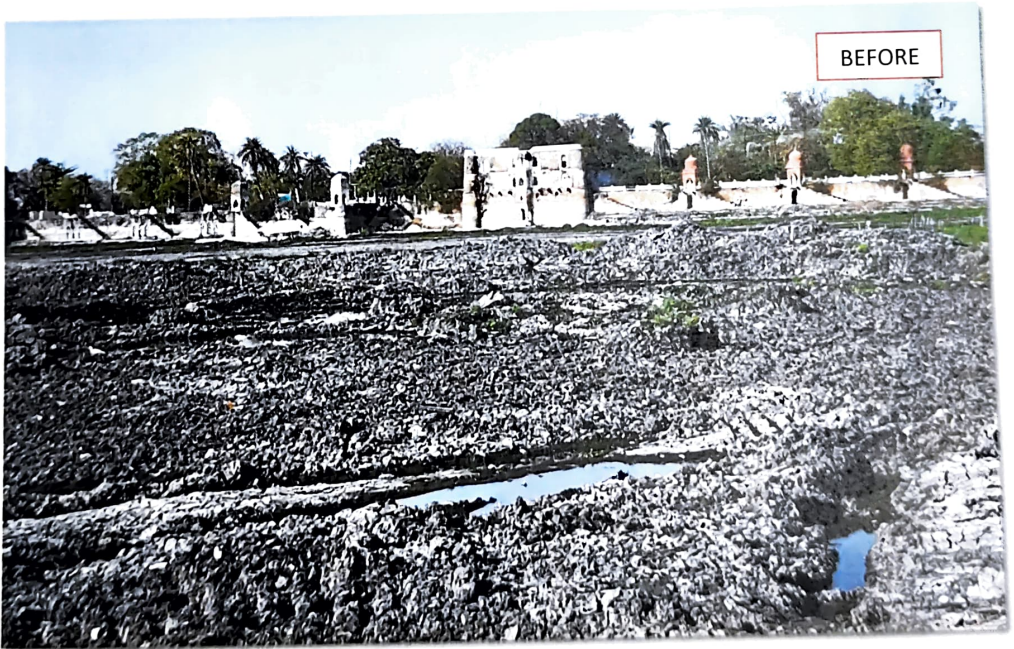
Figure: Showing Laxmi Taal before rejuvenation