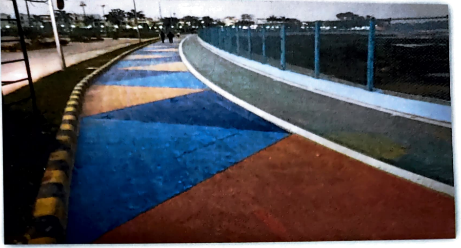
Figure: Showing pathway constructed over preexisting bund